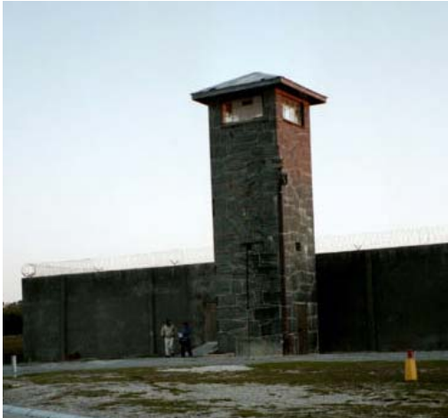
Robben Island Guard Tower

correspond to what you're looking at. In the end, the newness of the tactic has to do with the modernity of the problem. The tactic isn't new—it's the challenges that we must face that are new. To face these challenges, we have to update the existing. It is a French poet that said, 'let us sing in the old way about new things.' We must do the opposite.—Noel Twagiramungu, LDGL, Rwanda