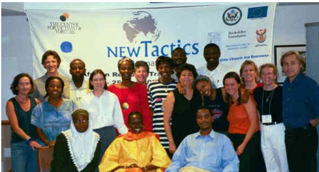
Africa Regional Training Workshop Participants and Staff

May 17– 25, 2003 Cape Town, South Africa