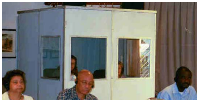
Translation booth and participants using the equipment

The Workshop was conducted with simultaneous translation in English and