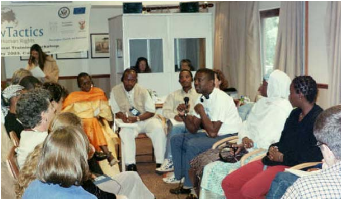
Interactive exercise on briefers process

practical position. Thus, they felt they owned the process and were able to contribute in an important way by making recommendations about reparations. Briefers could be used in many settings where vulnerable victims need mediation and support to overcome traumatic experiences—e.g. with victims of domestic violence or rape and in post-war court processes.