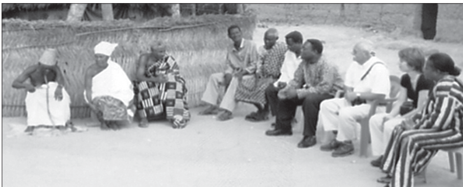
Negotiation / Priests & elders