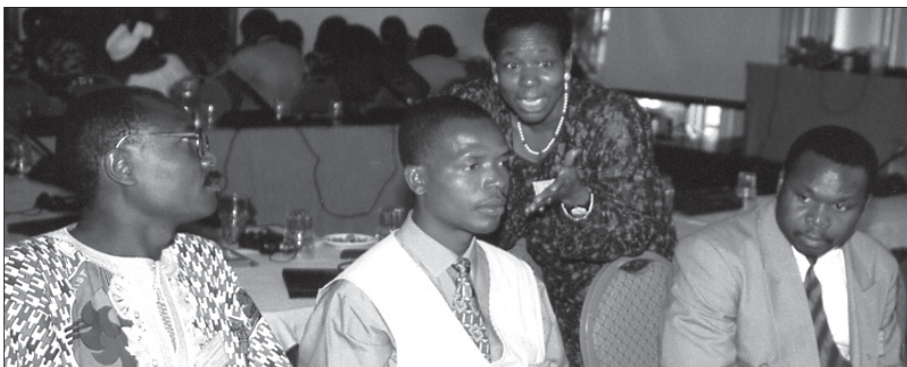
Signing legal documents / Togo & Benin