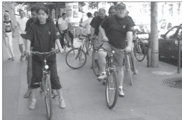
Starting line for the Tandem® race through Budapest, Hungary using a real tandem bicycle

We held three meetings, each over a two day period—two were hosted in Budapest and one in Vienna—between the Hungarian police, migrants and refugees living in Hungary along with experienced Tandem® program pairs from Austria. It was a very effective exchange. The result was the start of a Hungarian Tandem® program. Their activities differed from our Austrian model, because they met a lot in small groups and less in pairs. This was due to their difficulties finding willing migrant participants and in communicating the idea. For the Hungarian partners the idea of cooperation between police and an NGO was a new experience.