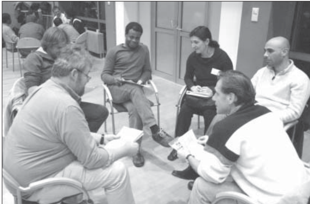
Tandem® seminar evening small group discussion

have a topic-relevant experience with each other and then discuss how it felt.