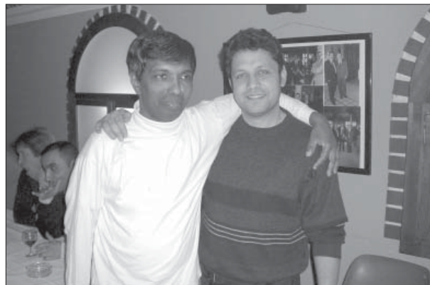
Tandem® participants together during closing celebration gathering—participant from India (left) and Romania (right)

The Tandem® experience relies on the creation of pairs between a police officer and a migrant. Through a series of mutual learning experiences, including discussions about their lives and issues important to them. Sessions include time for socializing and fun as well as constructive projects where the pairs learn to work together towards a mutually created product. Because the experience is extended over many months, close relationships develop among people not likely to be friends or working partners with each other.