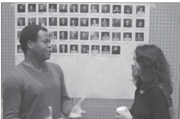
Two migrant Tandem participants with photo board of all Tandem participants hanging on the wall in the background.

Our experience is that participants unfamiliar with the Tandem® program can be quite nervous and excited in the beginning; this is especially true for police officers. They are accustomed to being in a commanding position with migrants, whereas in the program they find themselves without either the uniform or established position. Seminar moderators must create a neutral space for dialogue with equal rights during discussions.