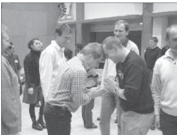
Communication activity: Participants are asked how to say hello to each other, each with a different “language and culture”