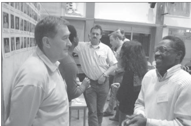
Tandem® program opening session-- informal talks between pairs during break time

The Tandem® program is based upon open and honest interaction between police participants and migrants. It is desirable to have migrant participants from many countries and cultural backgrounds who have experi-