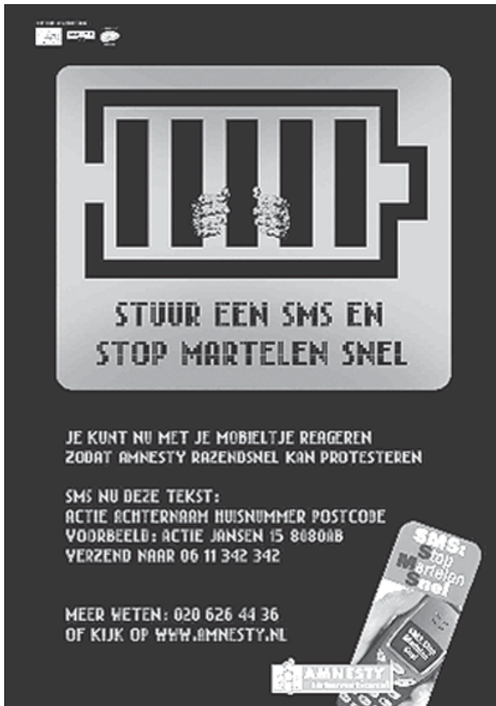
Poster for SMS campaign: "Send an SMS to stop torture fast."

an original idea and a good network of contacts. Amnesty is a well-known name in Holland with a general and uncontroversial appeal. Many people have friends or family who have done something with Amnesty, so it is not at all threatening. We took full advantage of this recognition in the sense that we were never hesitant to ask businesses to offer us services for free, knowing that they might think it was in their own interest to be associated with Amnesty's popularity.