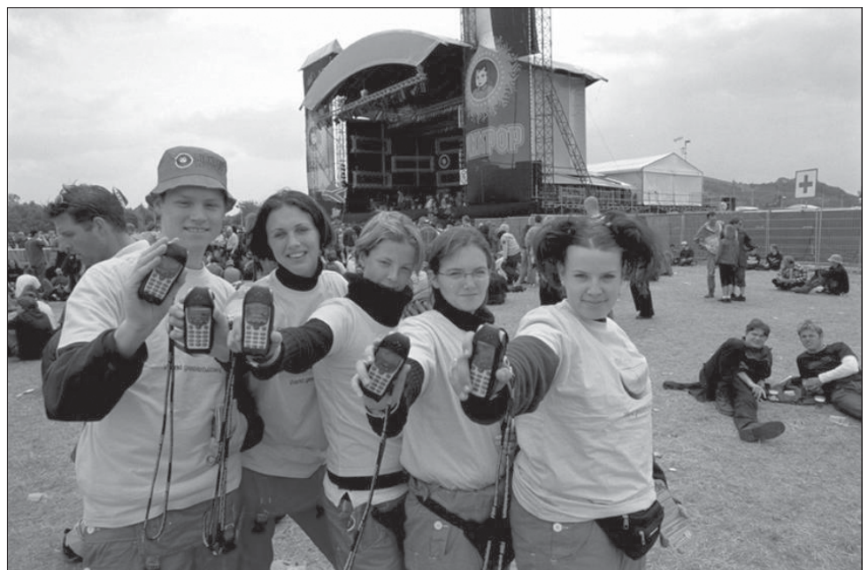
SMS campaign volunteers at a music festival.

We do have to make sure we don’t lose people’s enthusiasm and become an annoyance. Network members receive an urgent appeal every two weeks. This text is about a real person with a horrifying story, and we have learned from our users that no one thinks it is spam when they are touched by such a moving story and a chance to do something about it. But if members don’t react after three or four Urgent Actions, they will automatically receive a text message saying they won’t be a member anymore unless they voluntarily choose to continue. Often people send a message back to confirm that they are still interested.